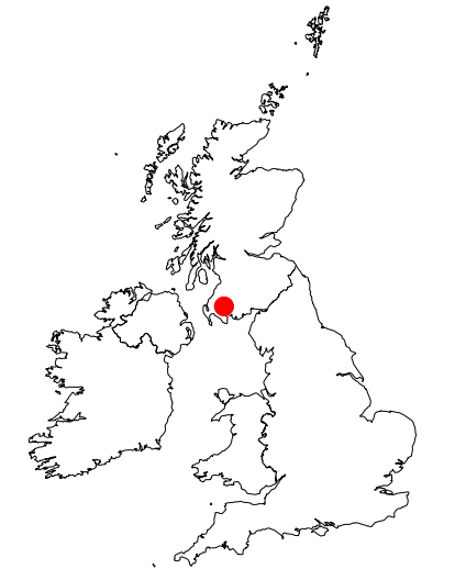
SITE LOCATION - NOT TO SCALE